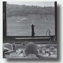
The Manufacture Audemars Piguet